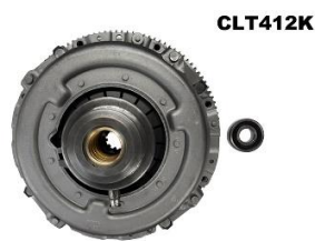
CLT412K – M45, Invicta Borg & Beck type clutch conversion, complete assembly.