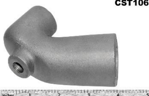
Low water pump, bottom elbow to radiator, 16/80, fully machined.