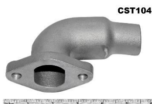
Low water pump, side elbow, 16/80, fully machined.