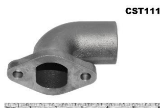
High Water pump, bottom elbow, 16/80, fully machined.