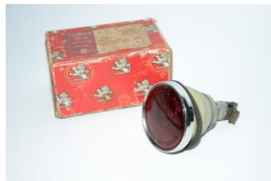
DB 2.6 stop/tail lamp, L461 new, old stock - £132.25