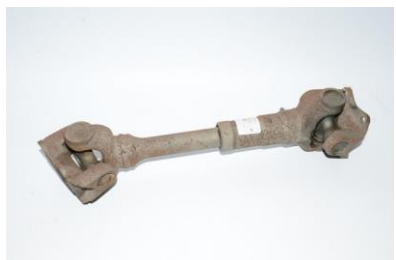
Half shaft, All 2.6 & 3 L - £86.25