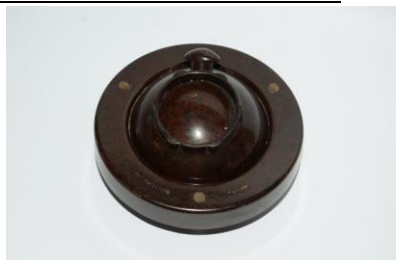
Footwell air vent, 3L - £55.20