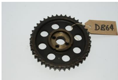
Camshaft sprocket, All 2.6 /3L - £34.50