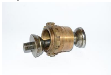
Rear suspension hub to radius arm link, All 2.6 & 3L - £80.50

Please visit https://www.lagondaclub.com/used-spares/ for more information.