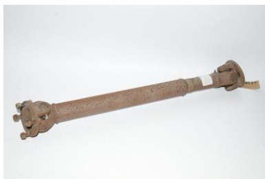
Centre Propellor shaft, All 2.6 & 3L - £69