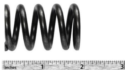
Clutch spring (200lbs/1") 3L